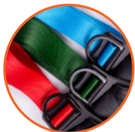
Colour coded webbing