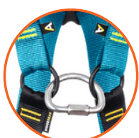
Front & rear attachment point