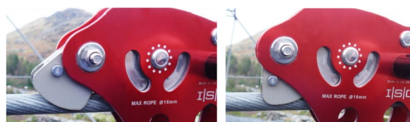
Cam in neutral position